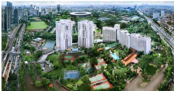
The Sultan Hotel & Residence Jakarta